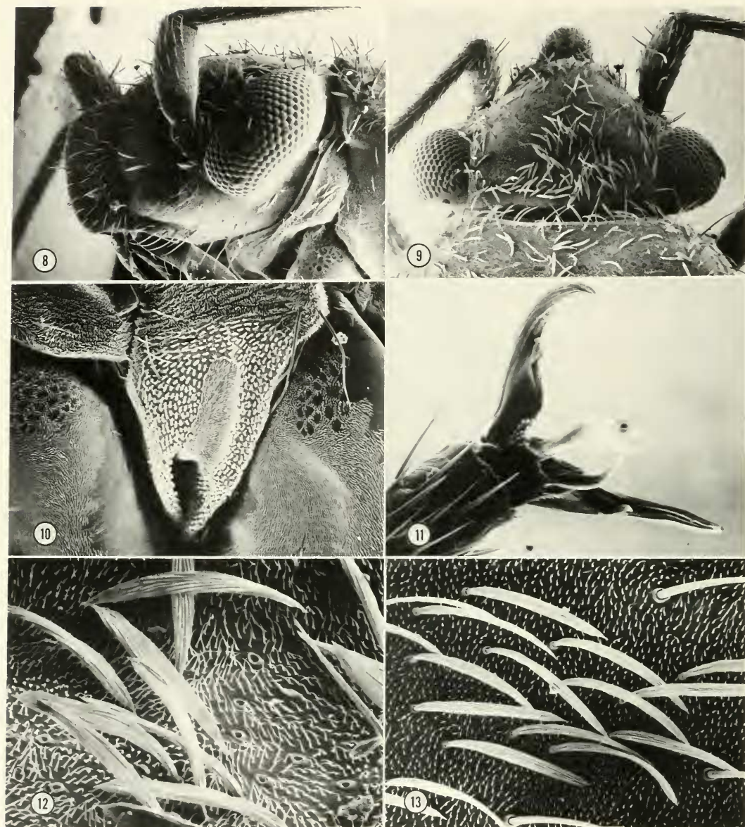
Figs. 8–13. Scanning electron micrographs of M. whiteheadi : 8. Lateral aspect of head (122 \times ). 9. Dorsal aspect of head (116 \times ). 10. Ostiole (253 \times ). 11. Claw (661 \times ). 12. Scalelike setae on scutellum (1090 \times ). 13. Scalelike setae on hemelytron (635 \times ).